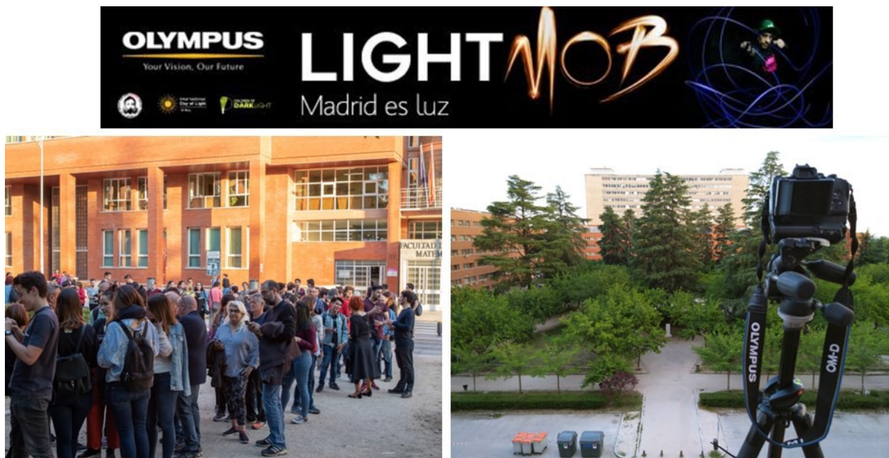
Figure 7. Announcement of the Light MOB event and some pictures.