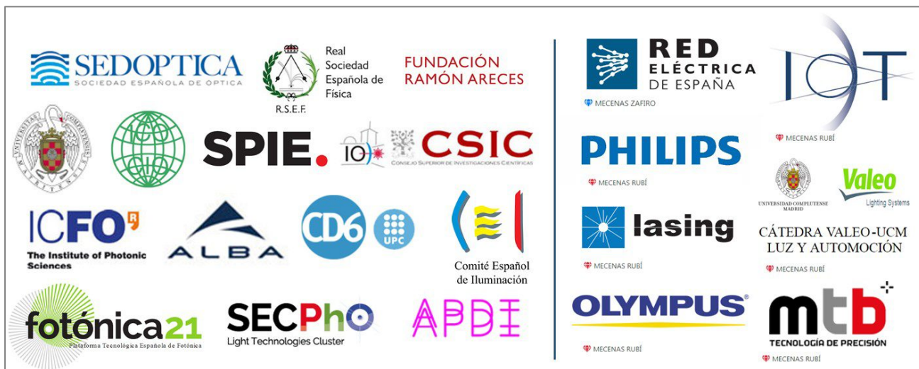
Figure 4. Sponsors (left) and patrons (right) of the IDL in Spain.