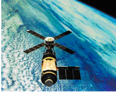
Fig 3 This satellite is a still image from Video 1 (Video 1, MPEG, 2.5 MB).